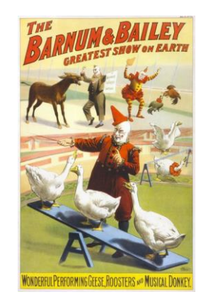
Advertisement for the Barnum & Bailey Circus, 1900