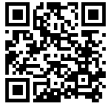
Figure 1 Pop See Ko: GoNoodle